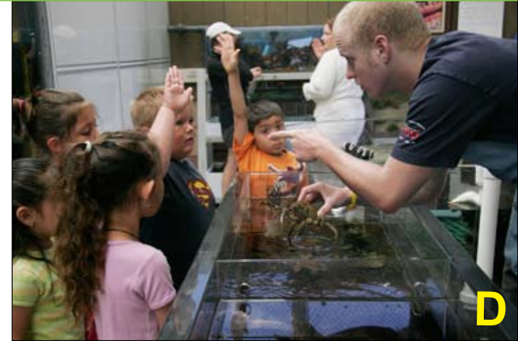
D What facility gives you an education & experience in research about marine science?