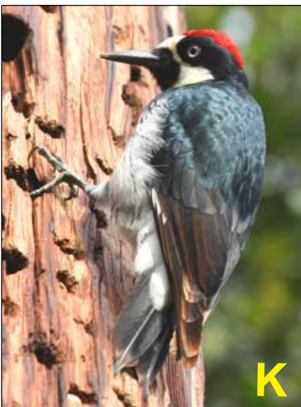
K Woodpeckers collect and store acorns at this native plant garden.