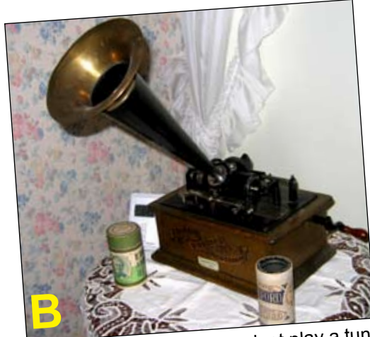
B Where can you hear this gadget play a tune?