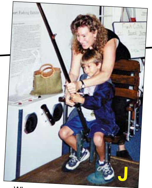
J Where can you reel in a big fish without going out to sea?