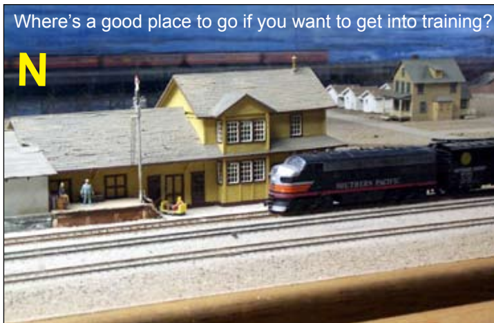
N Where's a good place to go if you want to get into training?