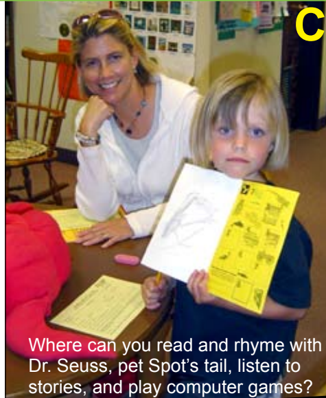
C Where can you read and rhyme with Dr. Seuss, pet Spot's tail, listen to stories, and play computer games?