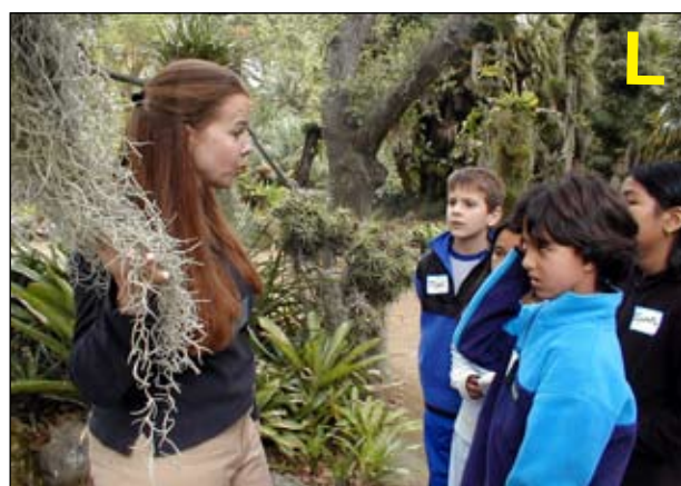
L Where can you learn about plants that don't grow in soil?