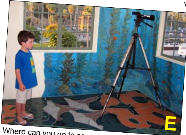
E Where can you go to see a cool kelp forest mural?