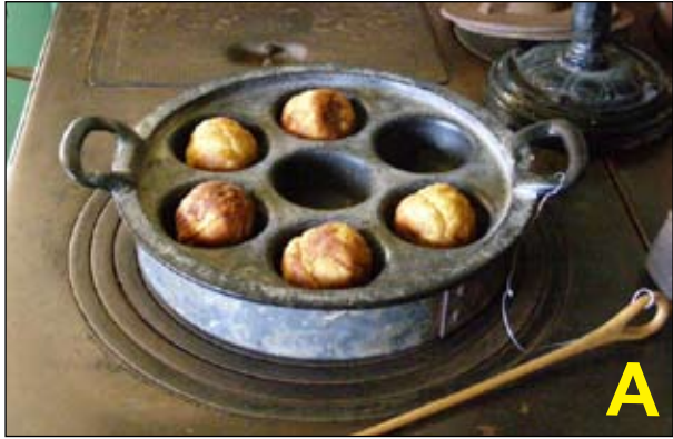
A Where can you find out who cooked with this pan and what is in it?